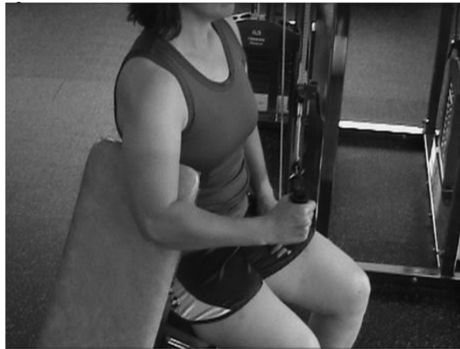
Fig. (2). External rotation.

shoulder in 30 degrees of flexion and 30 degrees of abduction. The maximal score was used as the measurement. Following isometric testing, each participant was placed in a sitting position on a multi-purpose bench with the elbow supported and the shoulder in an open packed position. The starting position included the elbow at ninety (90) degrees of flexion and the wrist in neutral. The pulley and bench were set up in a manner to allow for perpendicular angles of both the pulley rope with the humerus and the pulley rope with the forearm at mid-range. This allowed the rope to remain in the appropriate plane of movement. Resistance was provided by the STEENS pulley at approximately fifteen (15) to fifty (50) percent of the maximum isometric strength assessed during baseline testing. Each participant was then asked to complete active shoulder external (Fig. 2) or internal (Fig. 3) rotation to exhaustion. The screening resistance was adjusted to allow for an adequate number of repetitions to be assessed in the future testing session. Each participant was instructed in the testing procedures and given a testing appointment three weeks later to allow for full recovery from the baseline testing.