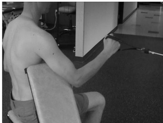
Fig. (3). Internal rotation.